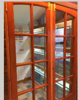
Photos Show early stage of the refurbishment of my fish room

Meet old friends and I hope make some new ones.